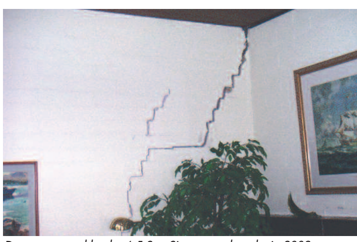
Damage caused by the 6.5 San Simeon earthquake in 2003